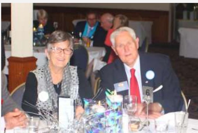
Kiwanis Australia 50th Birthday Dinner 2017