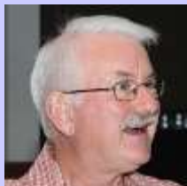
Our President 2019 2020 (Q2)