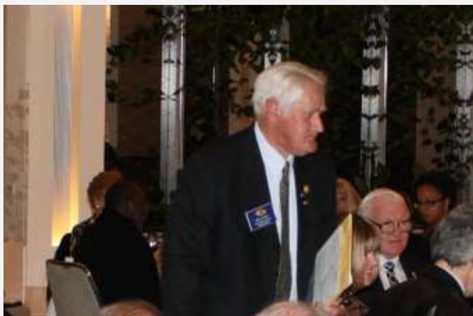
IP visit to Melbourne 2010