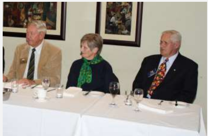
The annual Melbourne/Moorabbin inter club visit 2012