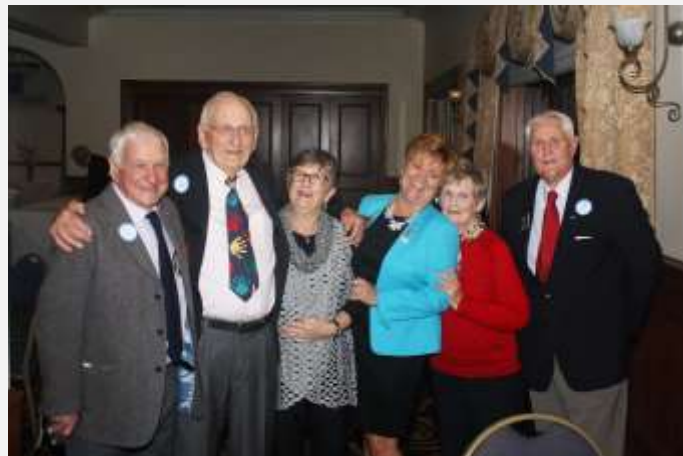
Six Old friends reunited 2017