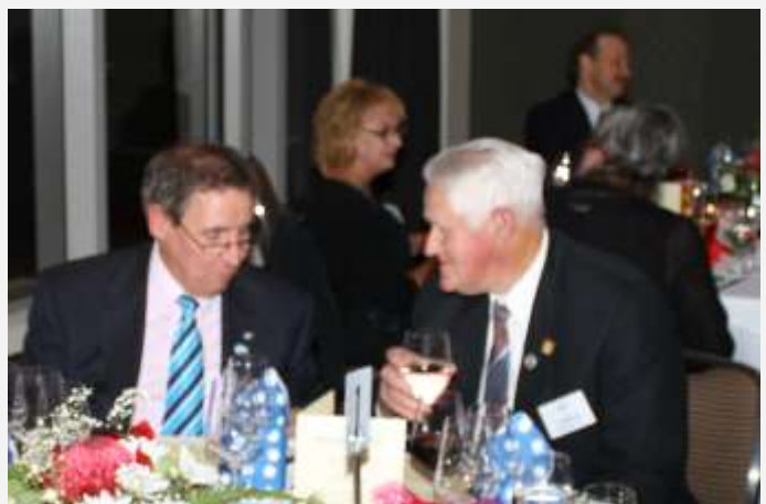
Eliminate Fundraiser at Melbourne 2013

When she saw her first strands of gray hair, she thought she'd dye