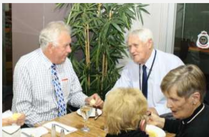
Past Governors dinner at the Melbourne Convention 2015